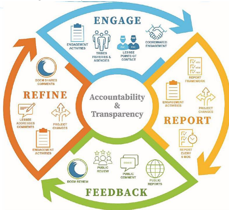
Figure 2. Principles for Successful Communication